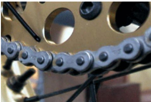
Note: This is a generic image

Once fitted, fill and prime the system and set the adjuster knob to 'prime'. Start the engine and turn the adjuster knob until a flow of between 1 and 2 drops per minute is achieved. Check the condition of your chain after a ride, and then adjust as required.