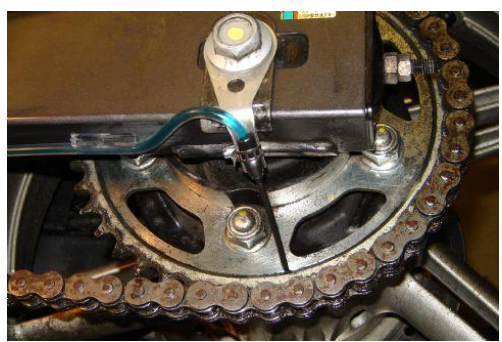
Note: This is a generic image