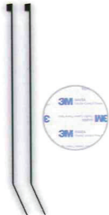
Cable ties & Doubled sided tape