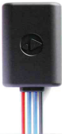
Indimate 2nd Generation